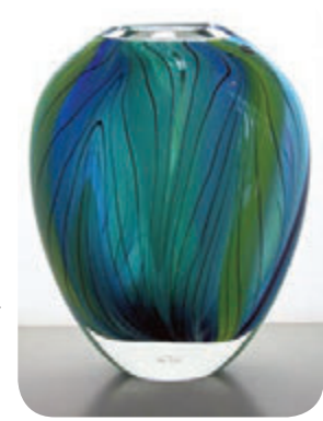
A NZ$4,000 vase at Höglund.

It is hoped that the turnout for the Napier gathering in February or March 2013 will be at least as large. It can surely be said, even now, that it will be happy!