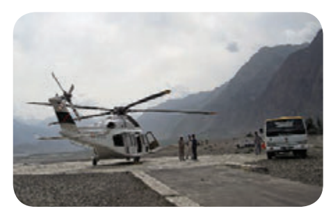
Helicopter in Skardu that we use to travel in Gilgit Baltistan, this is in Skardu, in stormy weather

world's highest mountain peaks— K2, Nanga Parbat, and Rakaposhi. Here the world's greatest mountain ranges meet the Himalayas, Karakoram, and Hindu Kush.