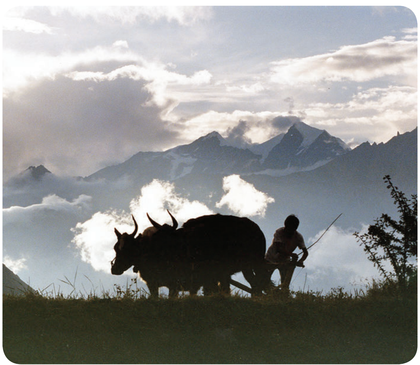
Plowing the clouds.