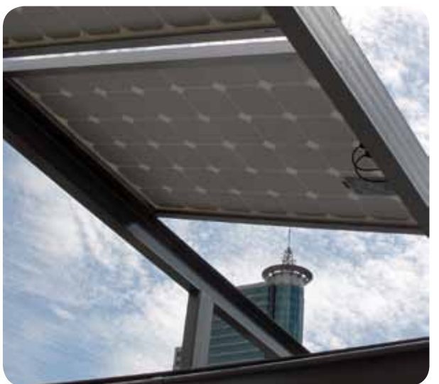
Solar panels on the roof of the new car parking building.

The answer is: "We LEED." Which means—ADB is working hard to make sure it's headquarters building is "green," that is, energy efficient and environmentally friendly. As noted in ADB's recently published Sustainability Report, "...as a commitment to "Green Building" initiatives, we opted to seek certification by the Leadership in Energy and Environmental Design (LEED) through the United States Green Building Council. Our application for LEED certification for existing building operation and maintenance was registered in May 2010. LEED certification focuses on sustainable sites, energy and atmosphere, water efficiency, indoor environmental quality, and materials and