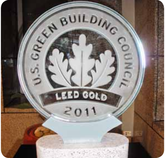
The United States Green Building Council awarded ADB LEED Gold certification for existing buildings: operation and maintenance.

ADB also sponsored the "Workshop on Sustainable and Net-Zero Buildings: Latest Trends and Technologies" held in Manila in June 2011. At the workshop, presentations included achieving LEED certification and emerging trends in green buildings.